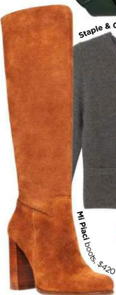
Mi Pacci boots, $420

No matter how remote the getaway, keep your style intact