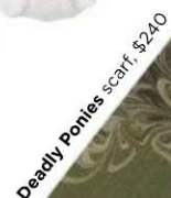
Deadly Ponies scarf, $240