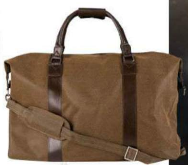
Citta bag, $74.90