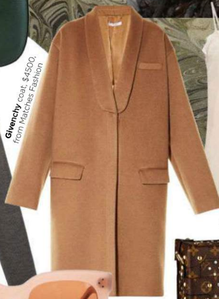
Givenchy coat, $4500, from Matches Fashion