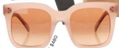
Celine sunglasses, $480