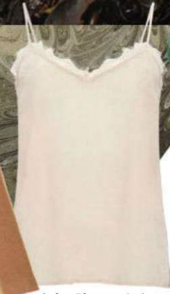
Anine Bing camisole, $289, from Superette