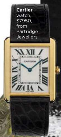
Cartier watch, $7950, from Partridge Jewellers