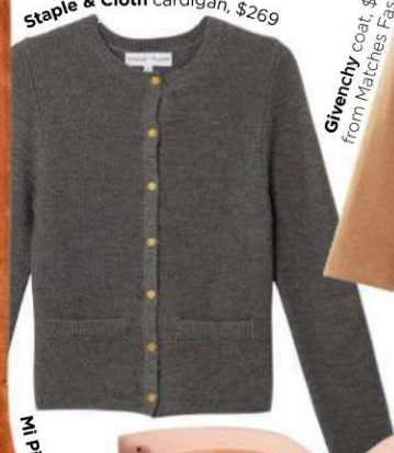
Staple & Cloth cardigan, $269