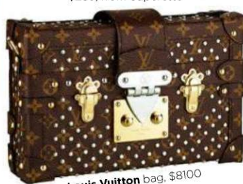
Louis Vuitton bag, $8100