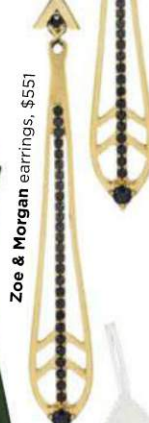
Zoe & Morgan earrings, $551