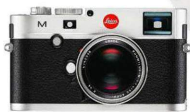
Leica M camera, $11299, from Photo Warehouse