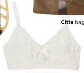
Ingrid Starnes bra, $119, briefs, $99