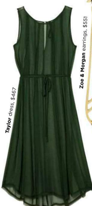
Taylor dress, $467